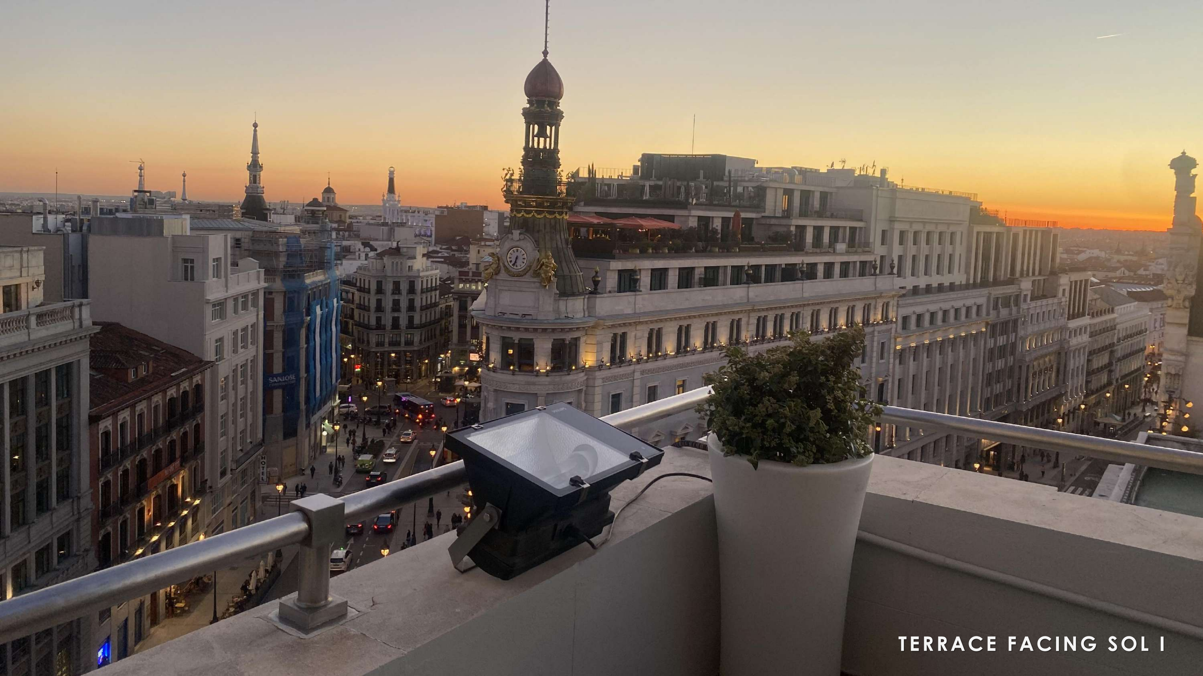
TERRACE FACING SOL I