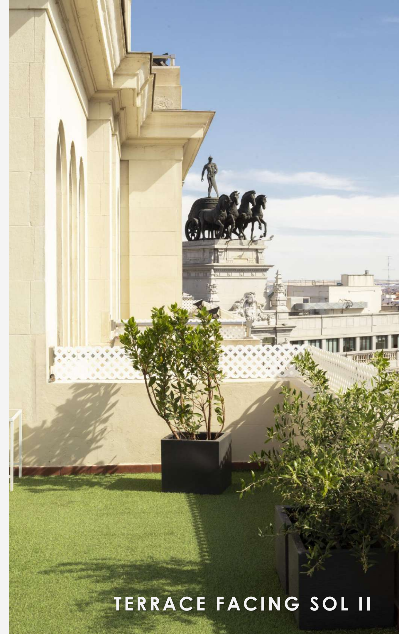
TERRACE FACING SOL II