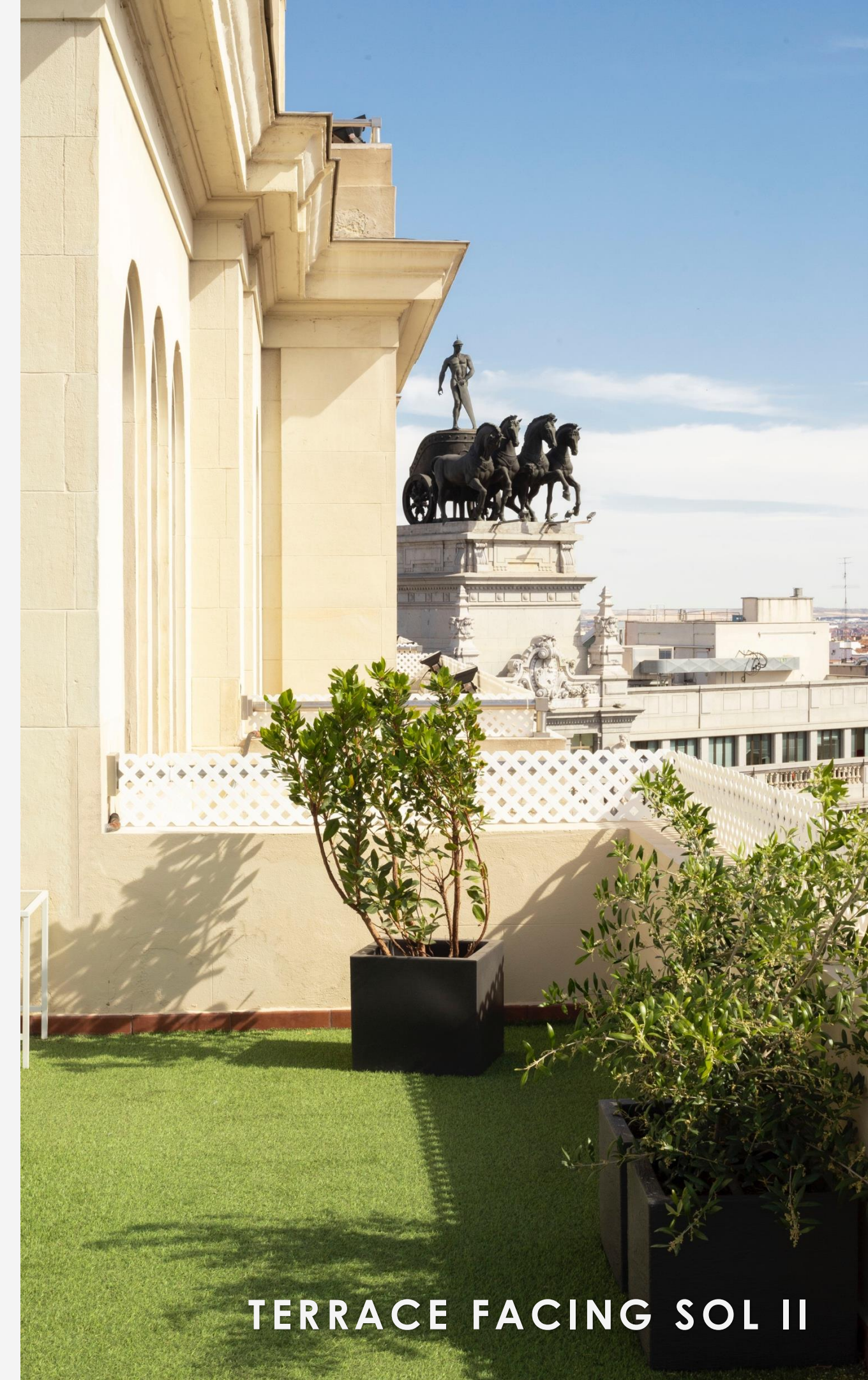
TERRACE FACING SOL II